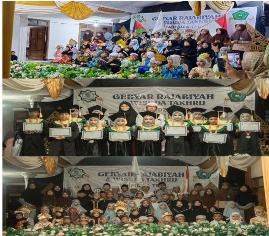
Figure 1. Moments Experience of Haflatul Imtihan at TPQ Tarbiyatul Quran

More than a mere memorization test, Haflatul Imtihan also plays a strategic role as a medium to strengthen Quranic understanding that can be applied in everyday life. The examination conducted is not limited to assessing the rote memorization of the Quranic text, but also emphasizes the comprehension of meaning and values within the memorized verses. This holistic learning approach unites cognitive and affective aspects, so students do not merely imitate, but truly understand and are able to internalize the Quranic messages, making their religious character development increasingly better. Beyond the aspect of learning, Haflatul Imtihan also provides an opportunity to strengthen social relations among students. Various supporting activities such as periodic recitations ( pengajian ), communal prayers, short lectures, and daily worship routines build a religious atmosphere in the TPQ that is more vivid and refreshing. The TPQ teachers also utilize this occasion to provide more focused guidance and personal assessment for each student, ensuring that the difficulties faced can be resolved quickly. This approach ensures every participant receives attention according to their needs and enhances the effectiveness of the learning process as a whole (Rahmita et al., 2023).